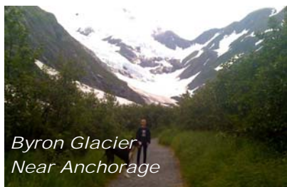
Byron Glacier Near Anchorage