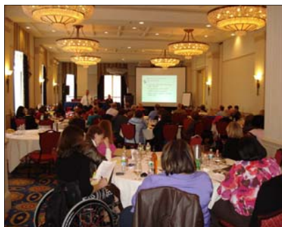
CSAPers hard at work!

Thank you all for your loyalty and support of CSAP. We look forward to Charleston in the spring for another great 50/50 and live auction.