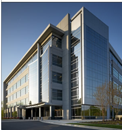
May CSAP 2013